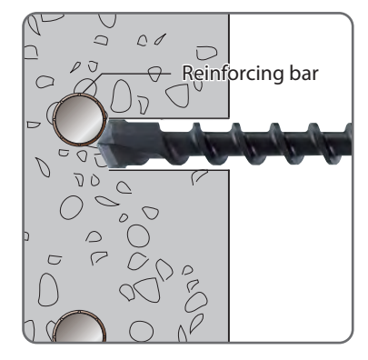
Torque limiter :: When drill bit hits against reinforcements, Torque limiter operates to stop.