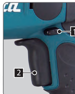
1 Reversing switch operable by one hand