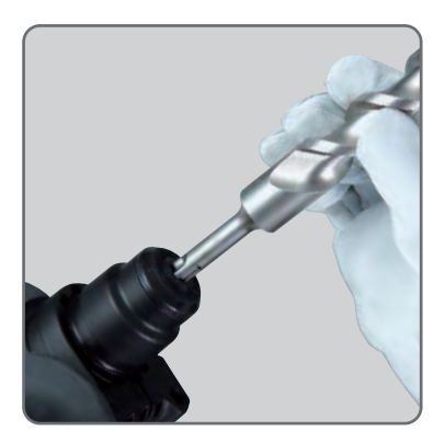
One-touch sliding chuck for easy bit changes