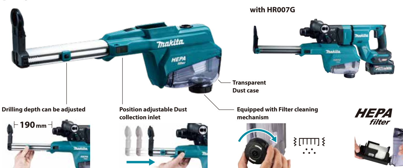
Dust case set Part No. 199586-0

DX15 Maximum bit size attachable: ø28mm x 260mm