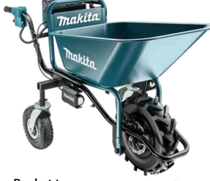
Bucket type can load sand, gravel, powder etc.